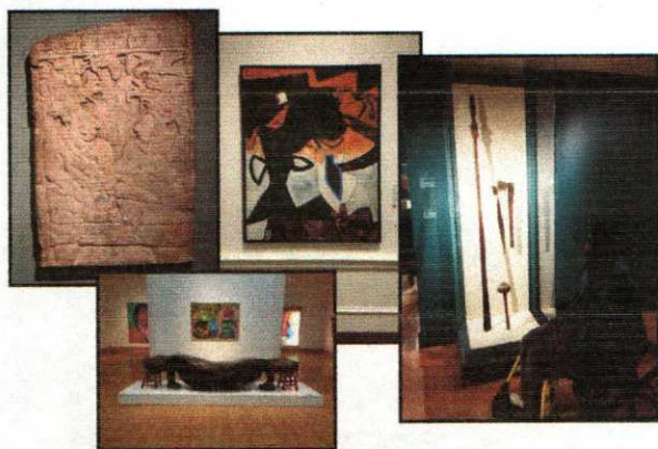
DAYTON ART INSTITUTE