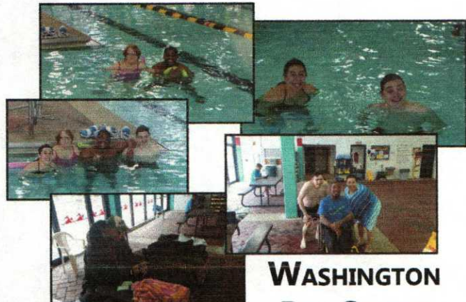
WASHINGTON REC CENTER